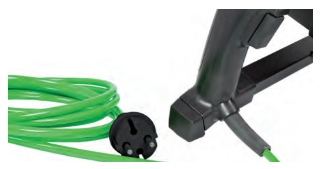
Dust protected electronic switch, PUR-construction site cable and a protected cable outlet