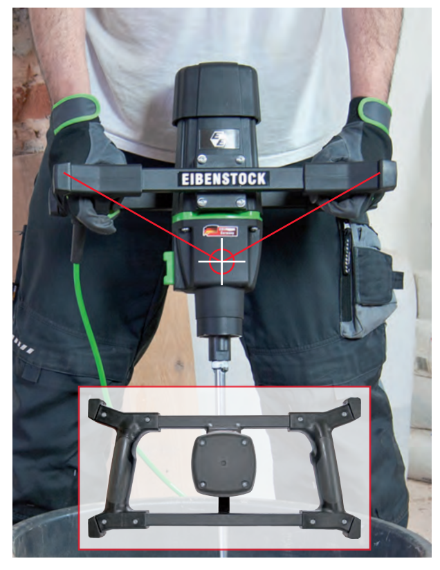
Wide, trapezium design, ergonomic handles and balanced center of gravity – easy, well balanced guiding of the machine for greater leverage