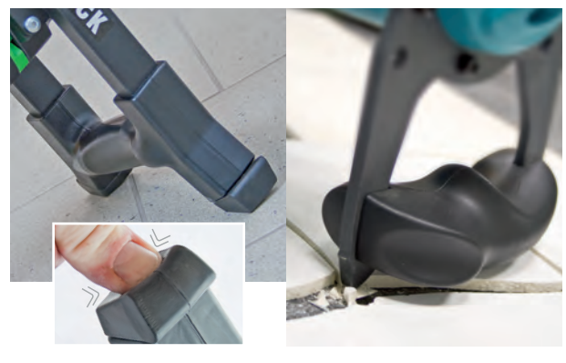
Damping and protection elements made of polyuretha ne – protection of the machine and the surface in case of unintentional fall